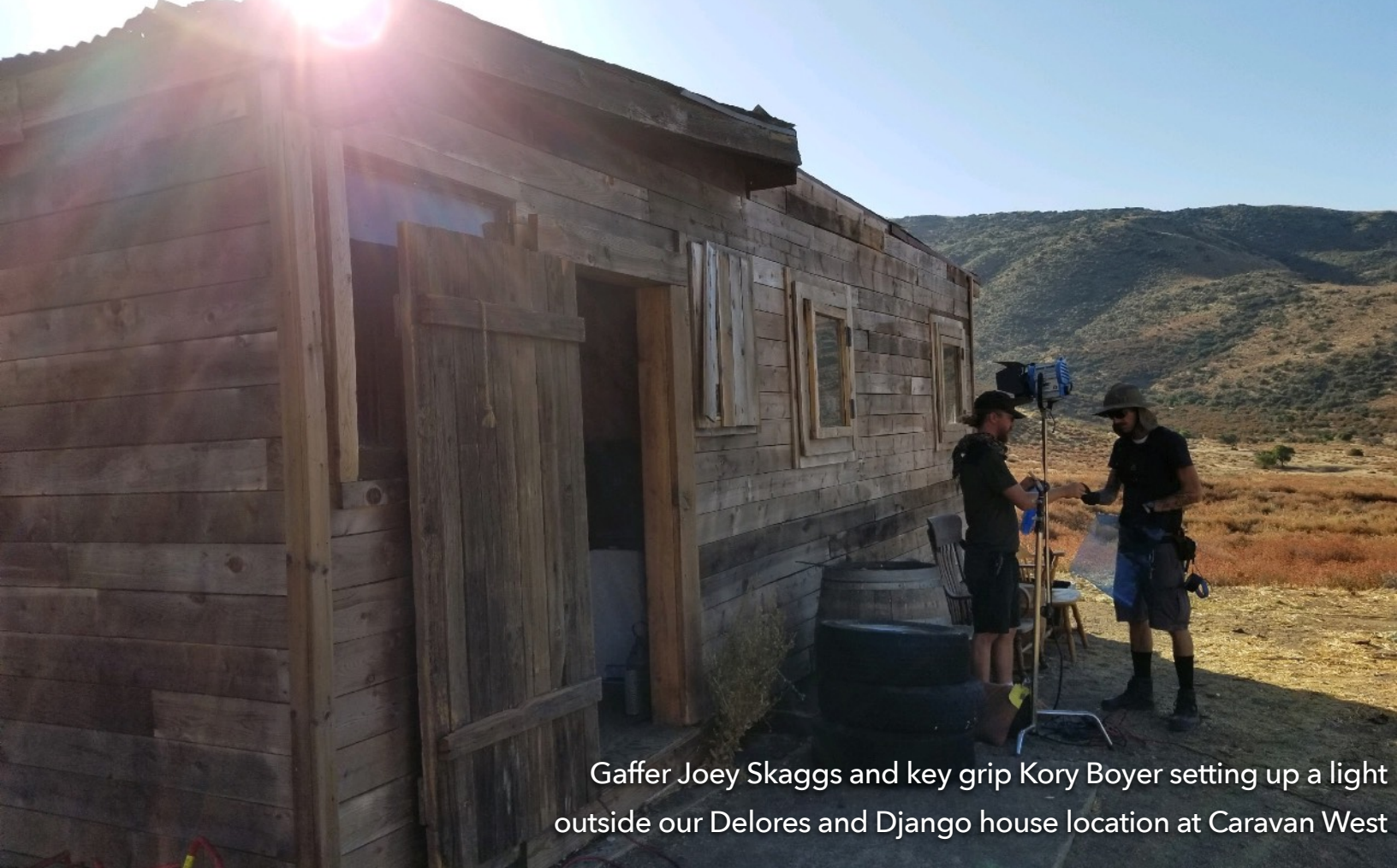
Gaffer Joey Skaggs and key grip Kory Boyer setting up a light outside our Delores and Django house location at Caravan West